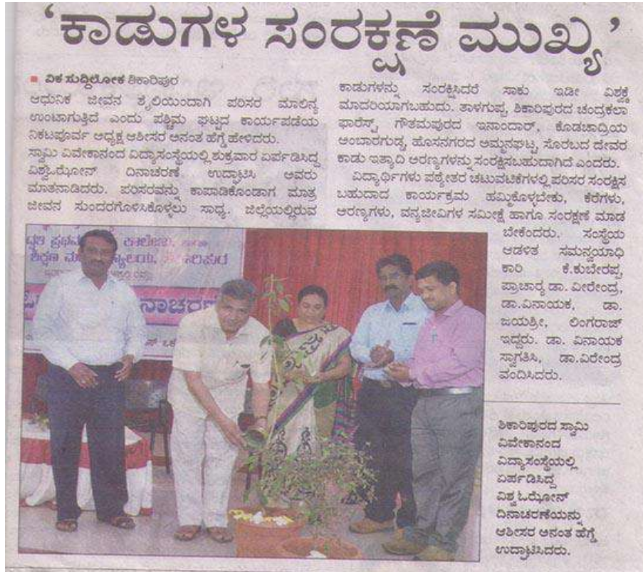
Celebration of World Ozone Day